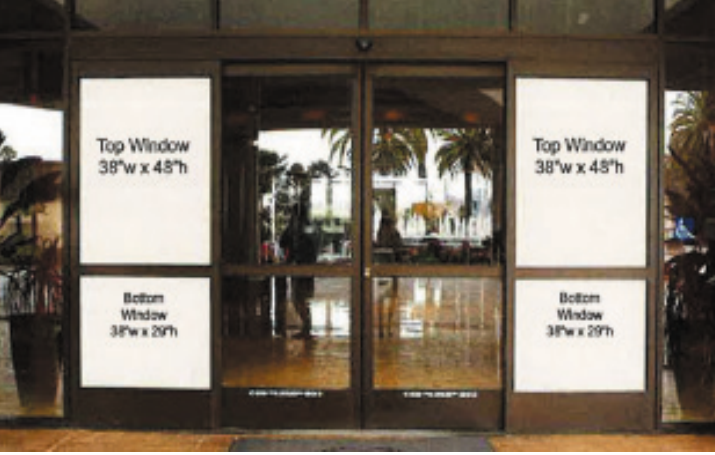
FIGURE A FIGURE B